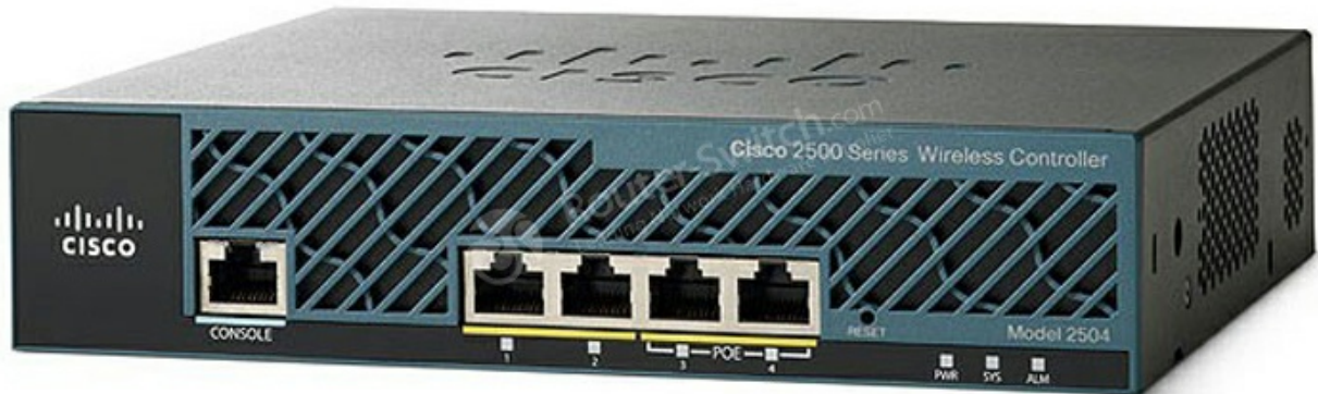
Table 1 shows the Quick Specs.

Figure 1 shows the appearance of AIR-CT2504-5-K9.