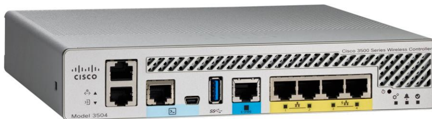
Figure 1. Cisco 3504 Wireless Controller

The Cisco Digital Network Architecture (Cisco DNA) is an open and extensible, software-driven architecture that accelerates and simplifies your enterprise network operations. The programmable architecture frees your IT staff from time-consuming, repetitive network configuration tasks so they can focus instead on innovation that positively transforms your business. SD-Access, as part of Cisco DNA, enables policy-based automation from edge to cloud with foundational capabilities. Cisco DNA Assurance, also part of Cisco DNA, provides a single source to monitor, modify, and manage your network and application data.