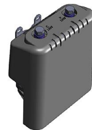
Figure 1. Cisco Aironet 1530 Series with Solar Shield/Cover

Enterprise customers are also looking to expand their wireless coverage and provide seamless network access from indoor to outdoor areas. The Cisco Aironet 1530 Series Outdoor Access Points are small enough and light enough to be unobtrusively mounted on street light poles or building facades. The integrated antenna version is just 9 x 7 x 4 inches (23 x 17 x 10 cm) and weighs 5 pounds (2.3 kg). A solar shield/cover option is also available, and can be painted to match its surroundings to allow the access point to be even less noticeable (Figure 1).