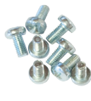
K-10 R2 screw kit