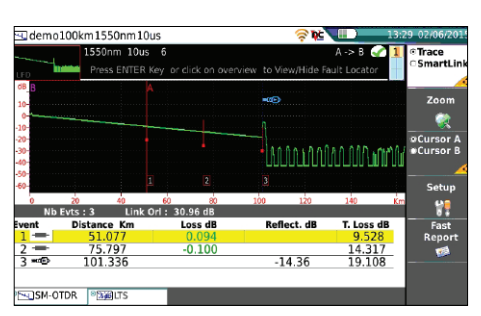
OTDR trace view