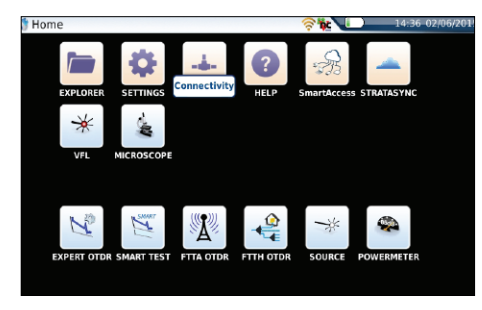
Combines all essential fiber tests in one handheld