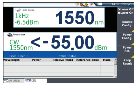
Built-in power meter and laser source